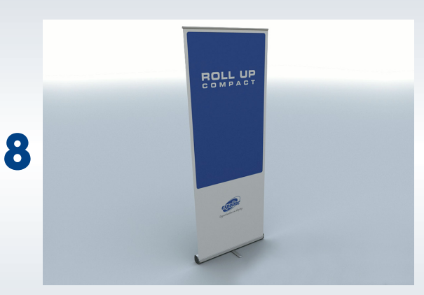
Verify that the system is even. READY!