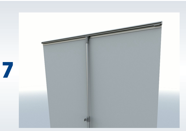
Chose desired height and seceure with the lock lever.